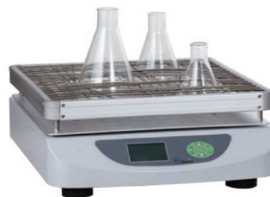
ST-WSZ100A / ST-WSZ200A